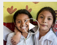
Skoll Awardee | Glasswing International