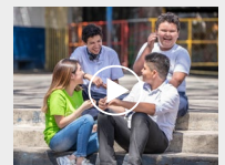
Schwab Foundation for Social Entrepreneurship Awards