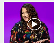
TED Talk | Mental health care that disrupts cycles of violence