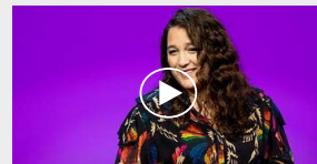
Mental health care that disrupts cycles of violence | TED Talk