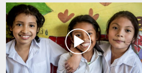
About Glasswing International