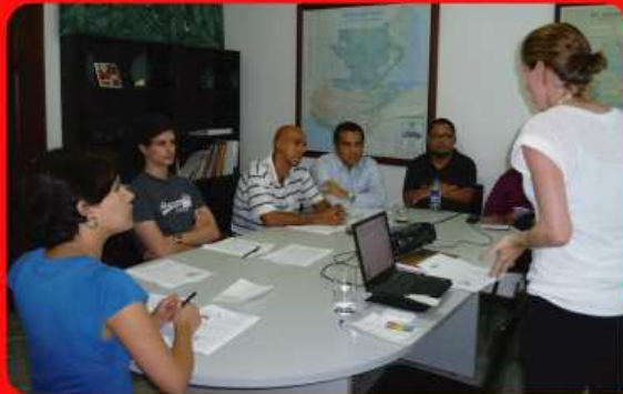
Volunteer teacher training.