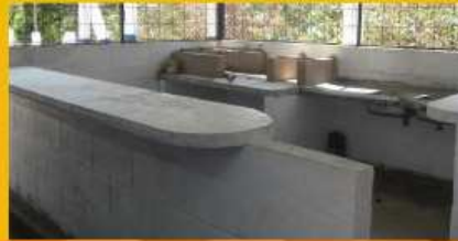
Infrastructure: Before and after.