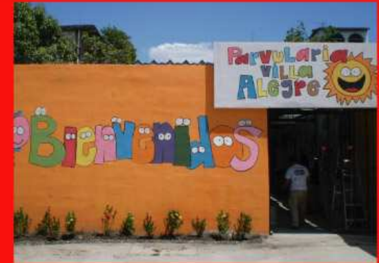
Transform 50 education and community spaces.