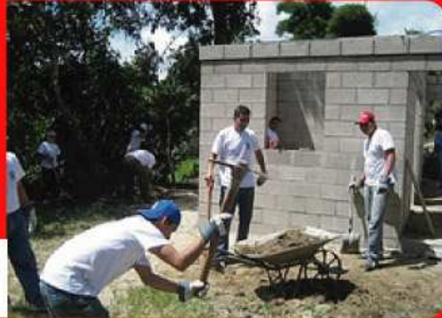
Volunteers help in construction of school.

Student Council President, Cimarrón Public School