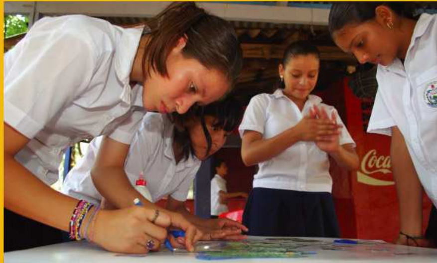
Students during their after school Art Club.