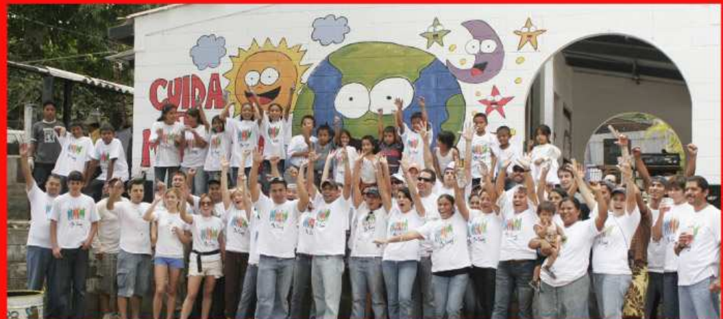
Mobilize 500 volunteer teachers and thousands of volunteers for security and infrastructure projects.