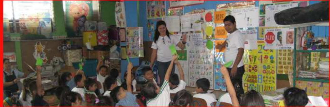
Offer extracurricular activities for thousands of children.