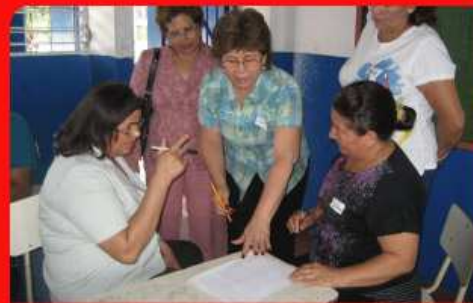
Teachers participating in education workshop.

Enrollment has increased by as much as 15% in some schools.